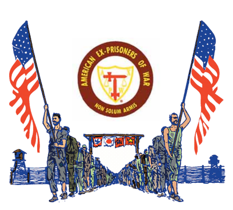
We exist to help those who cannot help themselves