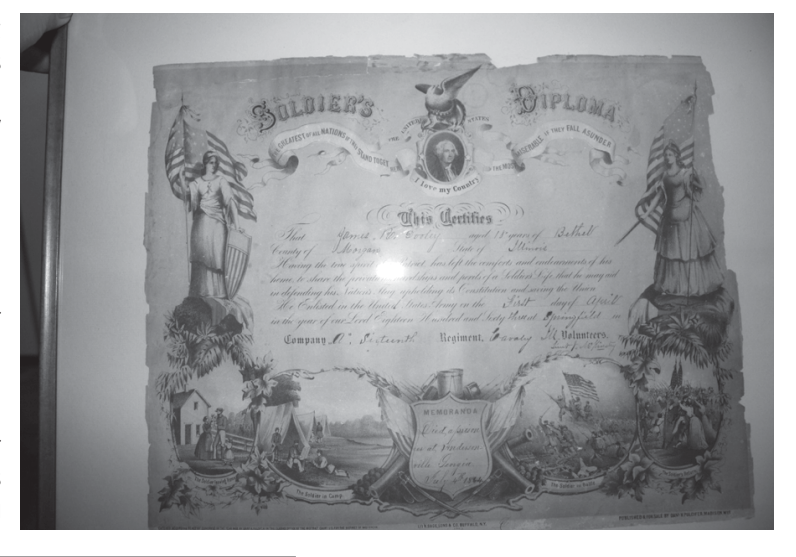
Ex-POW Bulletin Oct-Dec 2018 13

The park's museum collection continues to grow. This past year, gift donations included Vietnam era