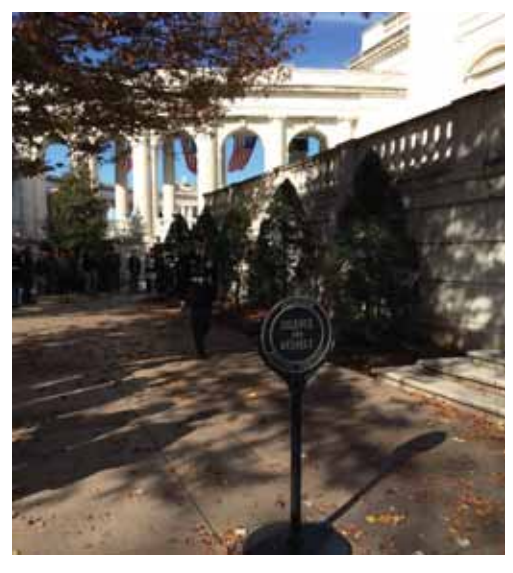
Honor. Remember. Respect.