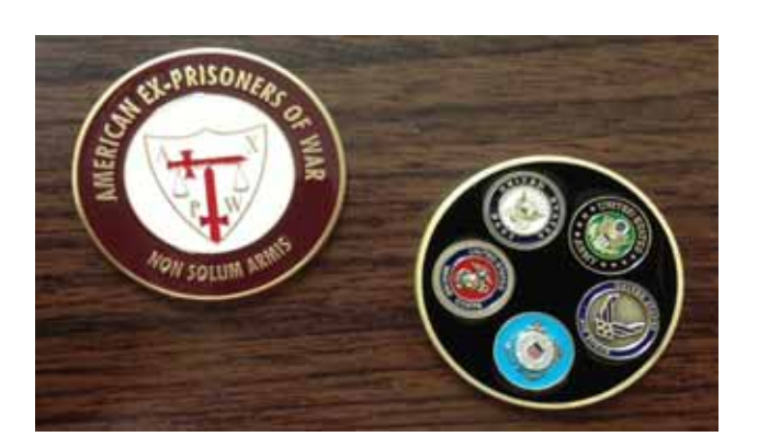
$13.00 includes S/H/I